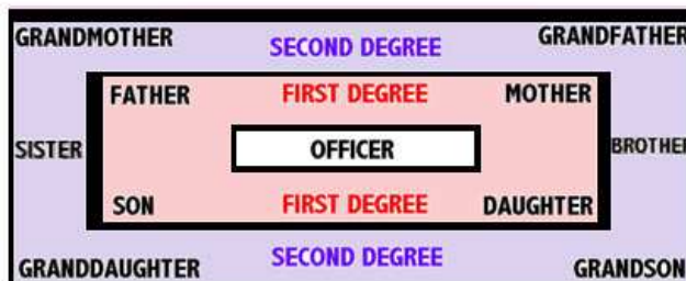
AFFINITY KINSHIP CHART